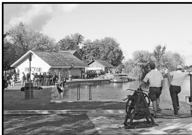
The Depot in Merrickville

Our retail outlet and interpretive centre, open during the summer, is conveniently located on the waterfront in Blockhouse Park, near the upper lock in Merrickville. There is plenty of parking and spacious grounds where you can picnic or watch the boats go by.