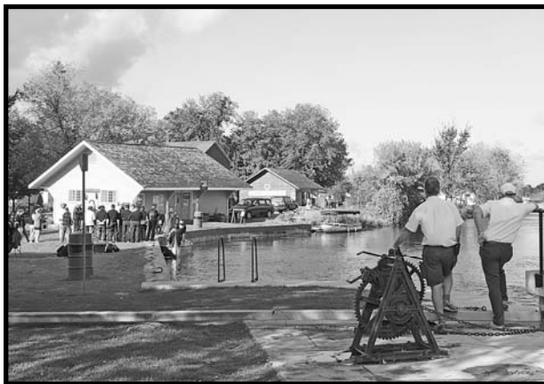
The Depot in Merrickville

Our retail outlet and interpretive centre, open during the summer, is conveniently located on the waterfront in Blockhouse Park, near the upper lock in Merrickville. There is plenty of parking and spacious grounds where you can picnic or watch the boats go by.